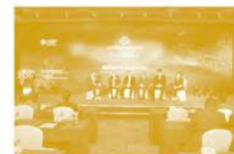
Summit Forum 2 : Forum on Trends and Latest Developments of Digital Trade