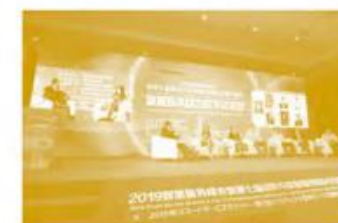
Summit Forum 3 : Forum on Trade Facilitation in Services: Perspective of Multinationals