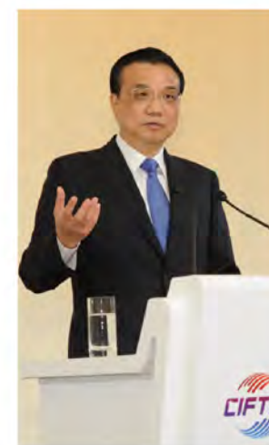
Premier of the State Council