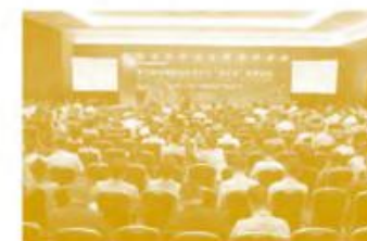
Summit Forum 1 : Forum on Emerging Trends in the Opening-Up and Development of Trade in Services

Focusing on hot issues and development trends in trade in services, representatives of international organizations and government agencies, and well-known guests from the industry, academia and research circles are invited to attend discussions and exchanges, share industry experience, and contribute their wisdom to development.