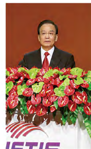
Then Premier of the State Council