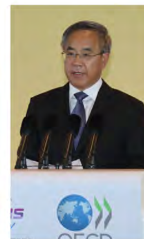
Vice-Premier of the State Council