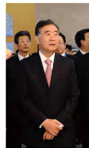
Then Vice-Premier of the State Council