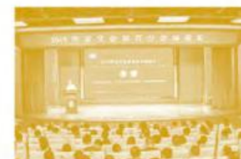
Summit Forum 4 : World Tourism Cooperation and Development Conference